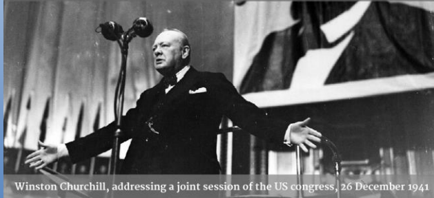
Winston Churchill, addressing a joint session of the US congress, 26 December 1941

“In the days to come the British and American peoples will for their own safety and for the good of all walk together side by side in majesty, injustice and in peace.”